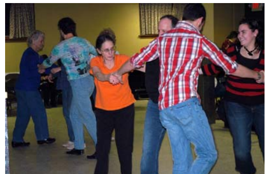
Old time Barn Dance Party at the Two Way Street Coffee House, February, 2008