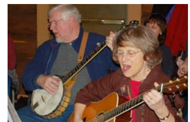
PRFMS members at the Annual Membership Meeting & Jam